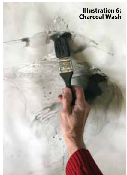
Illustration 6: Charcoal Wash