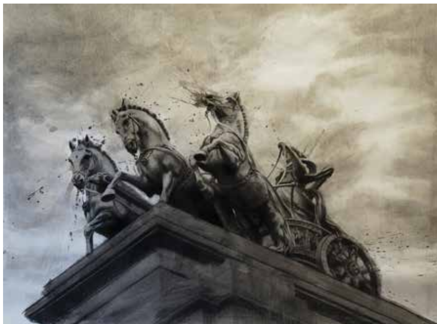
Equestrian, Barcelona I by Ephraim Rubenstein, 2014, mixed media on paper, 38 x 50.

reality, with concrete, tangible space, as opposed to the more amorphous space in which David's objects appear. Recently, our efforts have produced the exhibition "The Quickening Image," which will be on view at several locations this year and next.