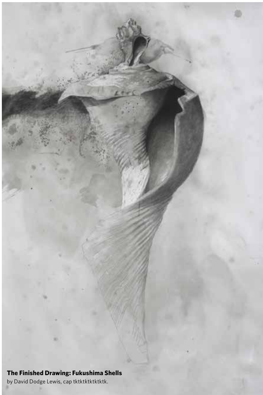
The Finished Drawing: Fukushima Shells by David Dodge Lewis, cap tktktktktktk.

drawing he wished to remain light gray. (See Illustration 4.) He then wet the paper and introduced another ink wash, this one slightly darker than the previous wash. This process of stopping out and putting down ink washes can be repeated as many times as you wish. Most of our drawings have two or three stages of waxing, but some