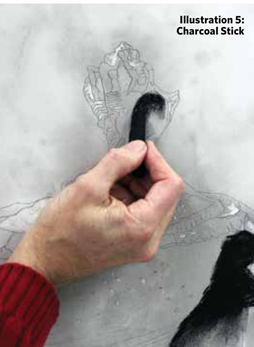
Illustration 5: Charcoal Stick