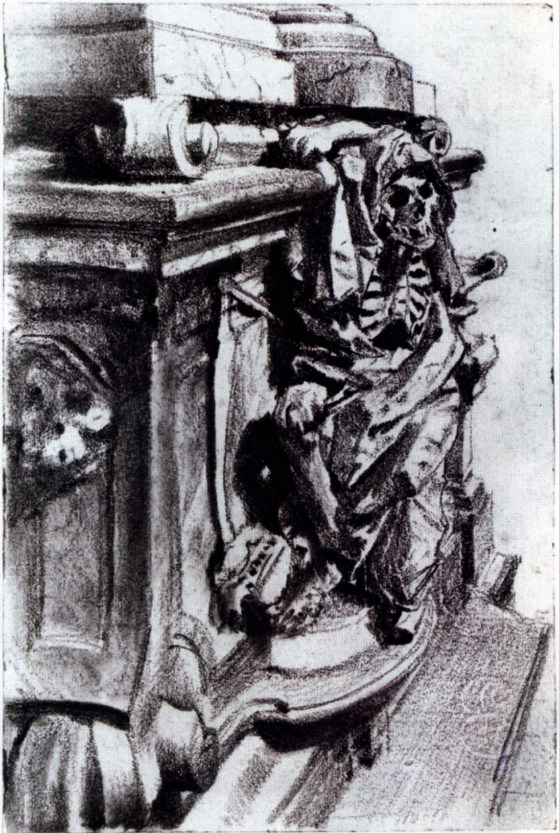
RIGHT Detail of the Tomb of the Prince von Thurn und Taxis at St. Emmeram in Regensburg

ca. 1890, graphite, 7 \frac{1}{16} x 5 \frac{1}{16} .